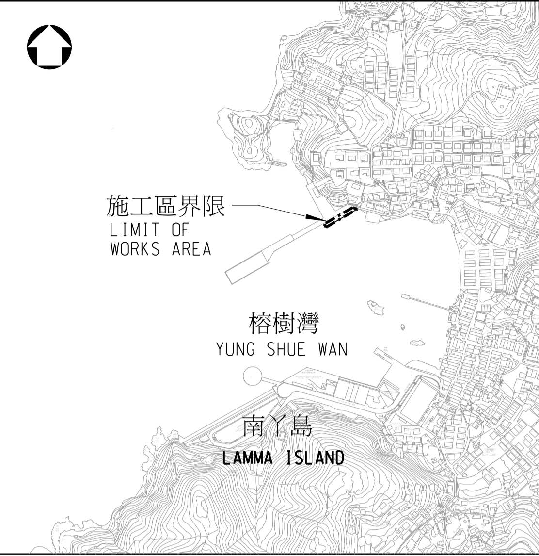
索引圖 KEY PLAN 比例 SCALE 1 : 5 000